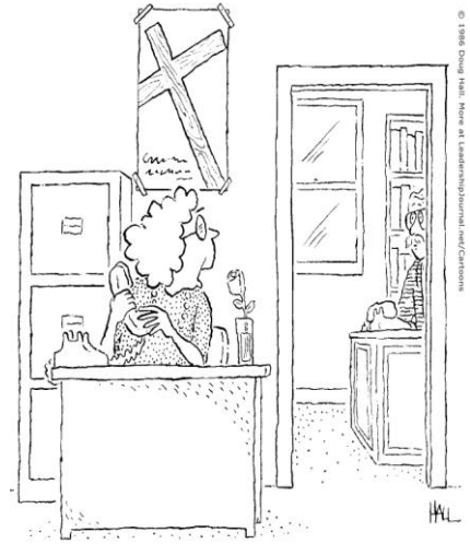
"A man from 'Ripley's Believe It or Not!' want a picture of someone on fire for the Lord."