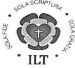
Table Talk II