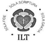
Table Talk II