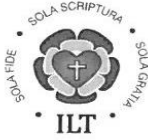
Table Talk II