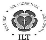
Table Talk II