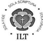
Table Talk II