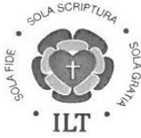
Table Talk II