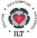
Table Talk II