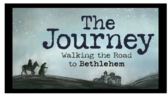
Join us for an Advent Bible Studay Each Sunday in Advent at 9:15am

A Monthly Publication of the Congregational Activities of Grace Evangelical Lutheran Church in Newton, NC email: gracenalcnewton@aol.com website: www.gracelutheran-newton.org Church Office: 704-462-1035 Volume 227, Number 12 DECEMBER 2024