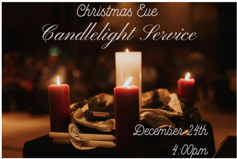
Please join us for Christmas Eve Candelight Service at 4:00pm