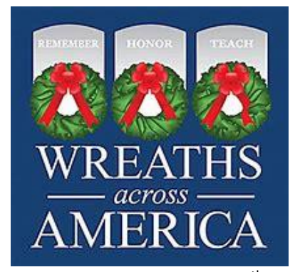
Saturday, December 14<sup>th</sup> Grace Cemetary 11:00am