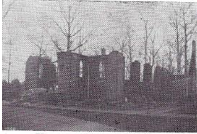
VIEW OF BURNED CHURCH

March 7, 1948 – Church building burned down, front doors survived.